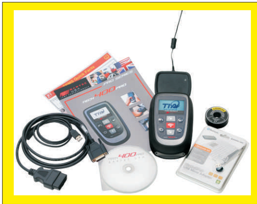
Part number: WRT400PRO Tech400PRO Kit

Buy a Tech400PRO, get a TIA chart, a roll of 25 Placard labels, and an extra year of software for a total of 3 years!