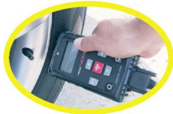
Easy to Use!