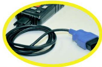
Robust and Rugged!