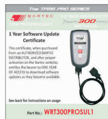
Part number: WRT300PROSUL1 for the Tech300PROC