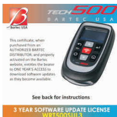
Part number: WRT500SUL3 for the Tech500