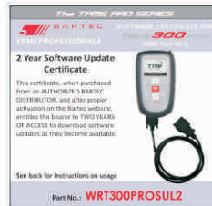
Part number: WRT300PROSUL2 for the Tech300PROC