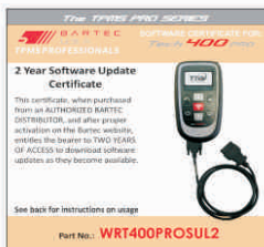
Part number: WRT400PROSUL2 for the Tech400PRO

Purchase a 2 year software certificate for a Tech400PRO, a Tech500, or a Tech300PROC and receive a Free TPG100 Digital Tire Pressure & Tread Depth Gauge & (4) Schrader 33500 EZ-sensors!