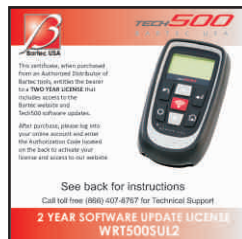
Part number: WRT500SUL2 for the Tech500