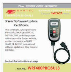
Part number: WRT400PROSUL3 for the Tech400PRO

Purchase a 3 year software certificate for your Tech400PRO, Tech500, or the Tech300PROC and receive Free (6) Schrader 33500 EZ-sensors and an additional 6 months of tool software!