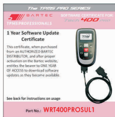
Part number: WRT400PROSUL1 for the Tech400PRO

Purchase a 1 year software certificate for a Tech400PRO, a Tech500, or a Tech300PROC and receive a Free TIA chart & (2) Schrader 33500 EZ-sensors!