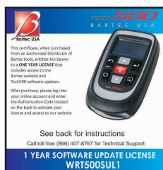
Part number: WRT500SUL1 for the Tech500