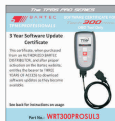
Part number: WRT300PROSUL3 for the Tech300PROC