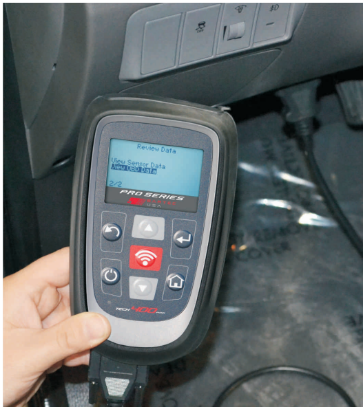
Tech400Pro connected to OBDII port.

Industry first OBD RELEARN and DIAGNOSTICS coverage, for Ford STATIONARY RELEARN vehicles. As you know, sometimes getting these vehicles into learn mode is a challenge. Doing the TPMS “Hokey Pokey” trying to get the horn to honk is often times frustrating.