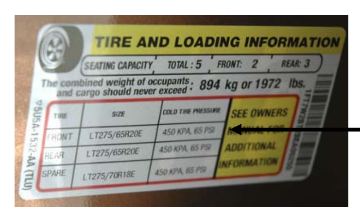
Low Pressure Range

If the vehicle placard calls for any pressures to be higher than 50PSI, you will need to use the HP (High Pressure) TPMS Sensor.